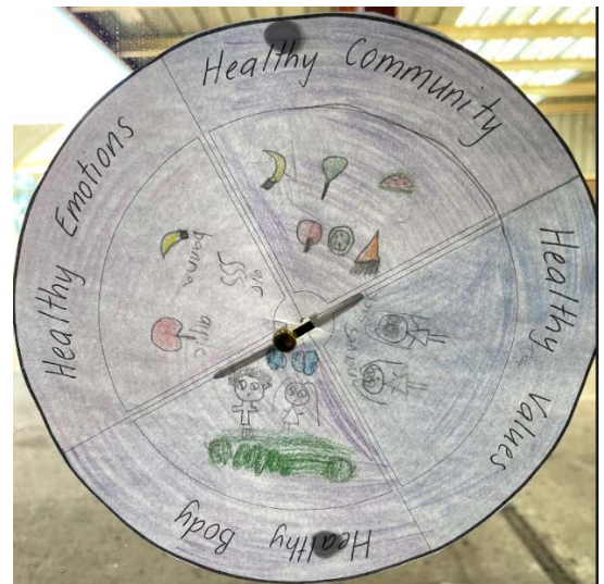
Year 3 have been considering the different dimensions of wellbeing and how they can be balanced