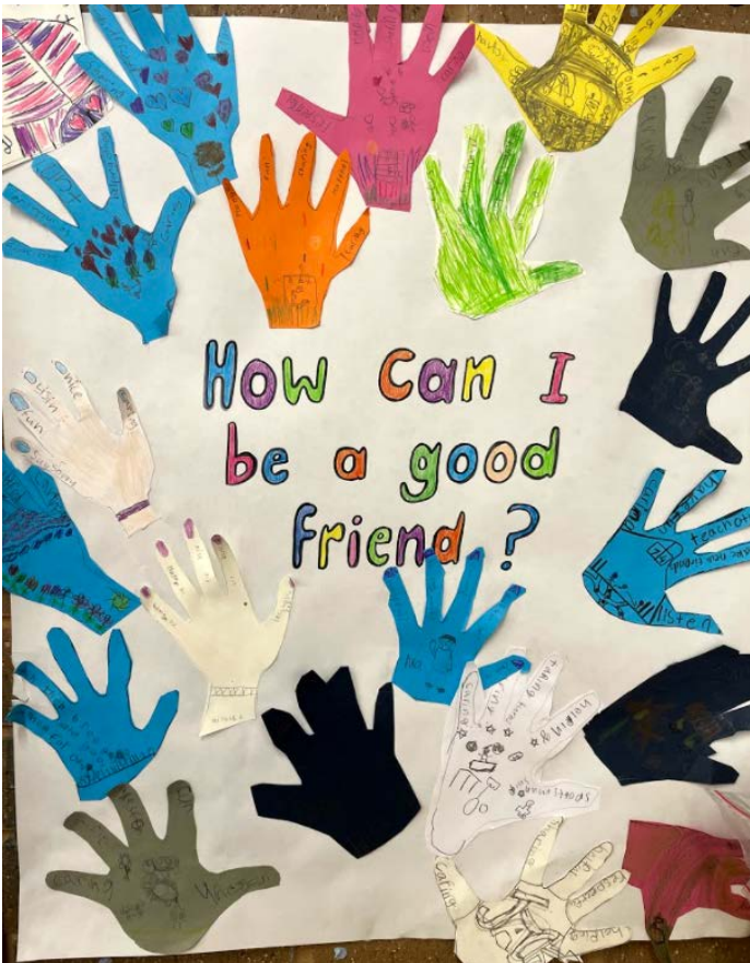
Year 2 have named the attributes of good friends.